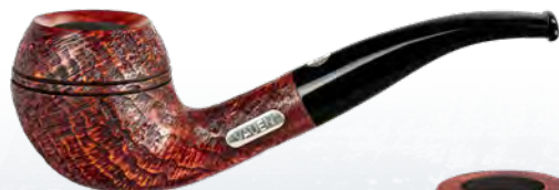
• Art.-No. JU 508