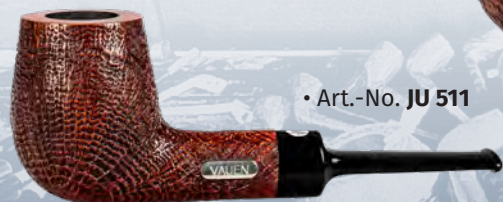
• Art.-No. JU 511