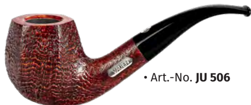
• Art.-No. JU 506