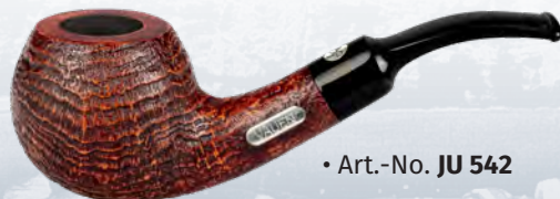
• Art.-No. JU 542