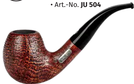
• Art.-No. JU 504