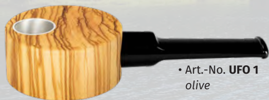
• Art.-No. UFO 1 olive