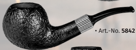
• Art.-No. 5842