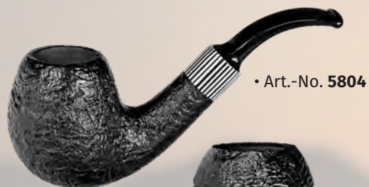
• Art.-No. 5804

The black mouthpiece and the six different bowl shapes underline its versatility. This pipe is the perfect choice for connoisseurs who want to combine the rough charm of nature with a touch of elegance.