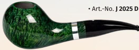
• Art.-No. J 2025 D