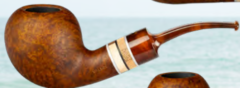
• Art.-No. OR 113