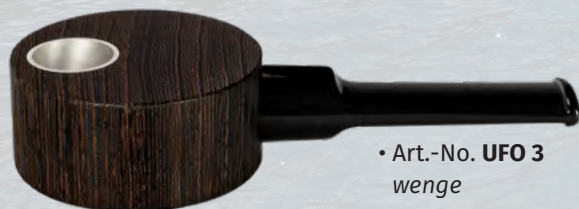
• Art.-No. UFO 3 wenge