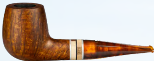
• Art.-No. OR 111