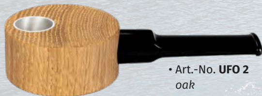
• Art.-No. UFO 2 oak