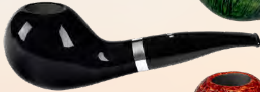
• Art.-No. J 2025 S