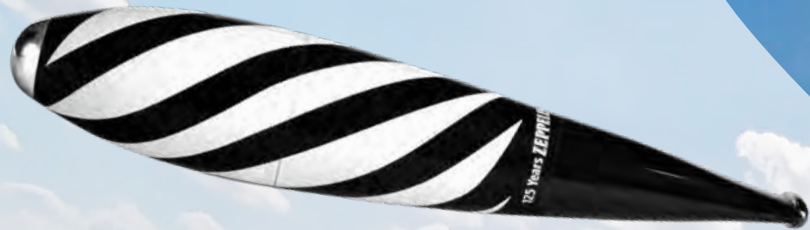
• Art.-No. ZEP JU SW