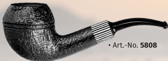
• Art.-No. 5808