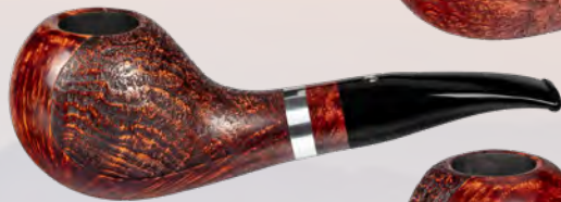
• Art.-No. J 2025 CO partially sandblasted