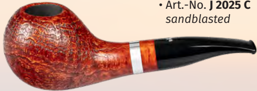
• Art.-No. J 2025 C sandblasted