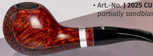
• Art.-No. J 2025 CU partially sandblasted