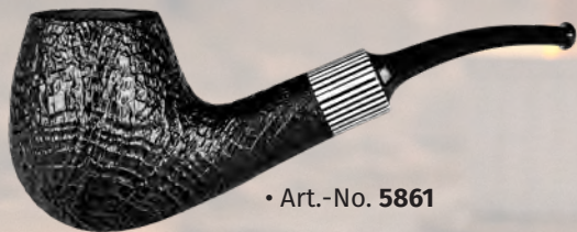
• Art.-No. 5861