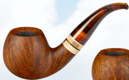
• Art.-No. OR 119