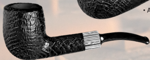
• Art.-No. 5868