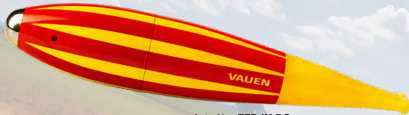
• Art.-No. ZEP JU RG

The Zeppelin first took to the skies on 2 July 1900 . To mark the 125th anniversary of the maiden flight of the LZ 1 on Lake Constance, we present our Zeppelin anniversary edition in an iconic design that captures the spirit of adventure and the freedom of flying.