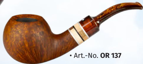
• Art.-No. OR 137