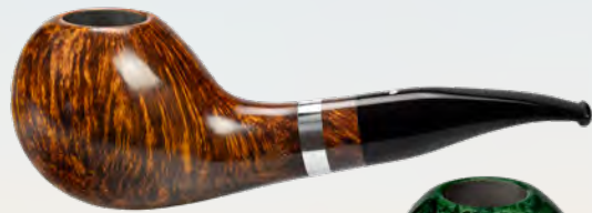
• Art.-No. J 2025 B