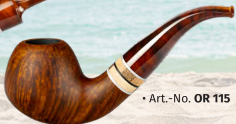
• Art.-No. OR 115

The Oregon expresses the tranquillity and naturalness of a summer day. The natural brown colour with a matching mouth-piece is the ideal complement to the elaborate wooden ring . This extraordinary application is created in delicate handwork , as is known from inlay or jewellery work . The two aluminium bands further enhance the ring and also protect the precious woods.